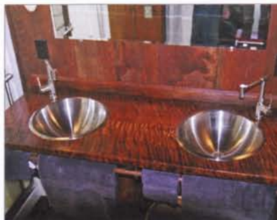
From L-R at top left: Hobbit fireplace; Fireplace room divider with copper chimney and trim; Granite topped curved kitchen peninsula; Detail fitted stone fireplace; Recycled ribbon redwood countertop; all from Copper Sky Construction.