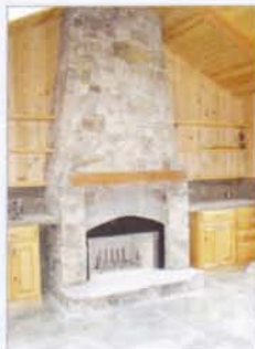
Helping to build temples like the one pictured gave Smith the discipline to set the stone on this fireplace using no grout at all.